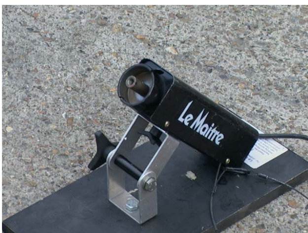
The Solenoid unit mounted on a board